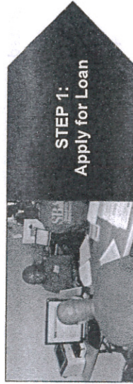
STEP 1: Apply for Loan

The U. S. Small Business Administration (SBA) provides low-interest, long-term disaster loans to businesses of all sizes, private non-profit organizations, homeowners, and renters to repair or replace uninsured/underinsured disaster damaged property. SBA disaster loans offer an affordable way for individuals and businesses to recover from declared disasters.