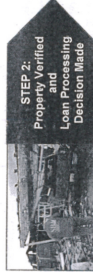
STEP 2: Property Verified and Loan Processing Decision Made